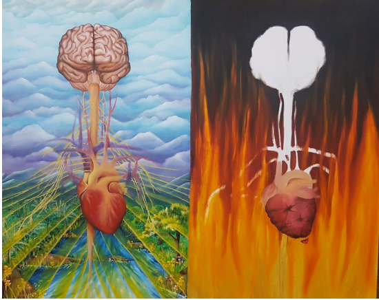
This painting is just an example of what I learned as well. Still painting.